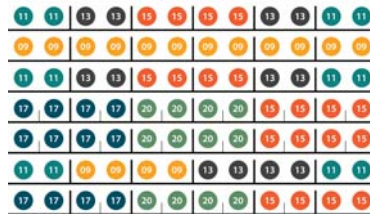
Merchant Media 6-Wide 58 Select Standard Model