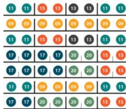
Merchant Media 4-Wide 38 Select Standard Model